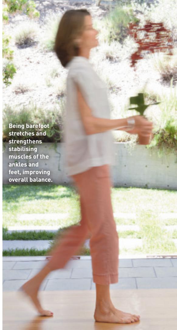
Being barefoot stretches and strengthens stabilising muscles of the ankles and feet, improving overall balance.

Strengthen the inner bra of your pectoral muscles by placing your hands together in prayer and pressing your palms firmly together for three breaths. Go braless and massage your breasts daily to ensure proper circulation and lymph flow.