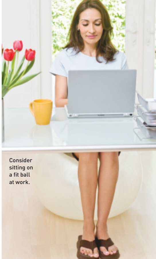
Consider sitting on a fit ball at work.

Esther Gokhale teaches "stretch sitting", which entails hoisting your upper back up against the chair to decompress the lower back. She explains, "Your lengthened back muscles contribute to improved circulation,